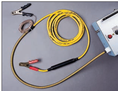
Permanently mounted cable set and ground cable