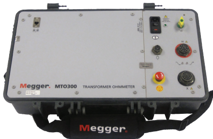
MTO300 (use with external PC with PowerDB)