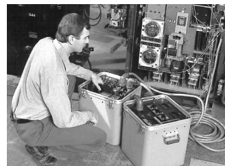
Model NTS-300 testing a Westinghouse network protector