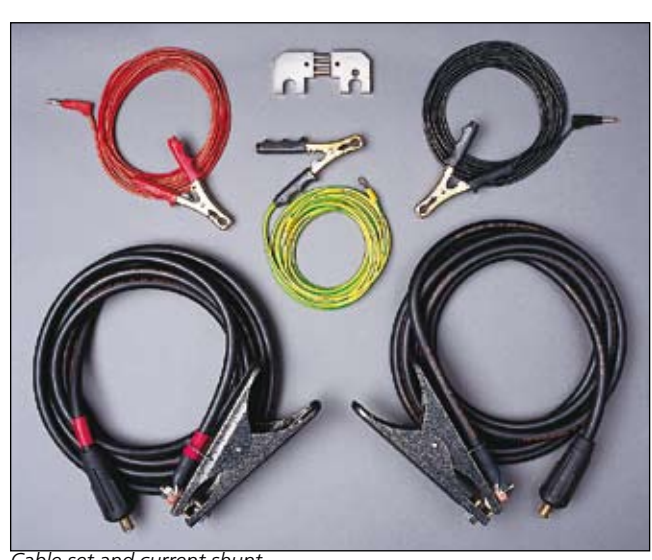
Cable set and current shunt